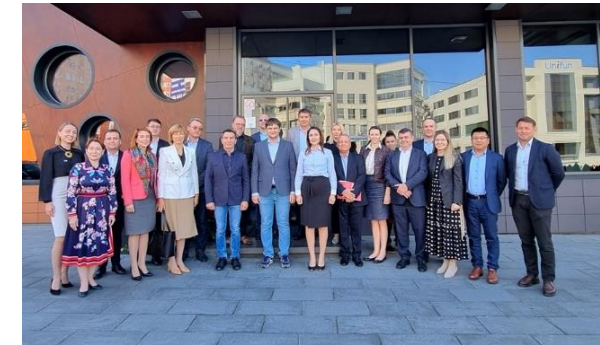
Mr. Andrei SPINU, Deputy Prime-minister, MIDRM