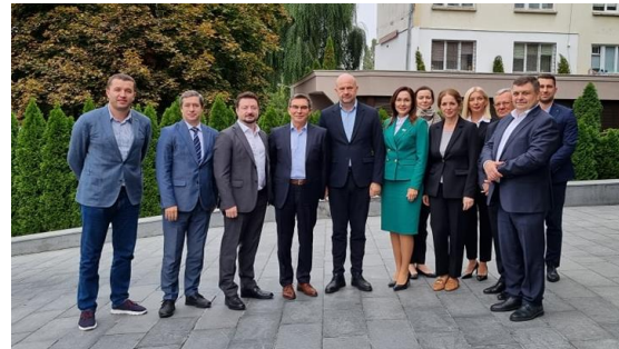
Mr. Vladimir BOLEA, Minister of Agriculture and Food Industry