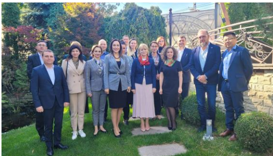
Ms. Ala NEMERENCO, Minister of Health