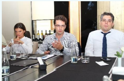
Economic Council Secretariat to the PM