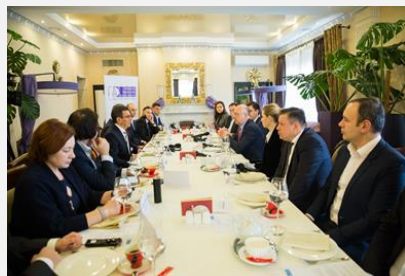
Mr. Pavel Filip