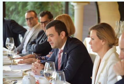
Mr. Chiril Gaburici